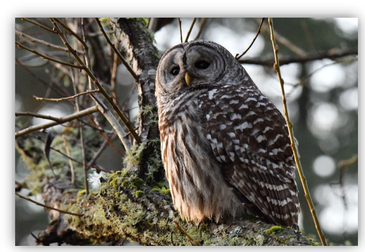
"Let us pledge our lives and fortune to aid the great task of Earth's rejuvenation, and with confidence and faith, each do our part as a trustee of Earth to take charge and take care of our planet."

A 404 removal-fill permit is typically required for projects involving 50 cubic yards or more of alteration (removal or fill) of streambed, streambanks, or in wetlands. For projects located in essential salmon habitat waterways or state scenic waterways, any quantity of alteration requires a removal/fill permit. There are four types of removal/fill authorization.