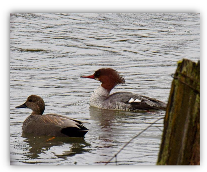
"The activist is not the man who says the river is dirty. The activist is the man who cleans up the river.