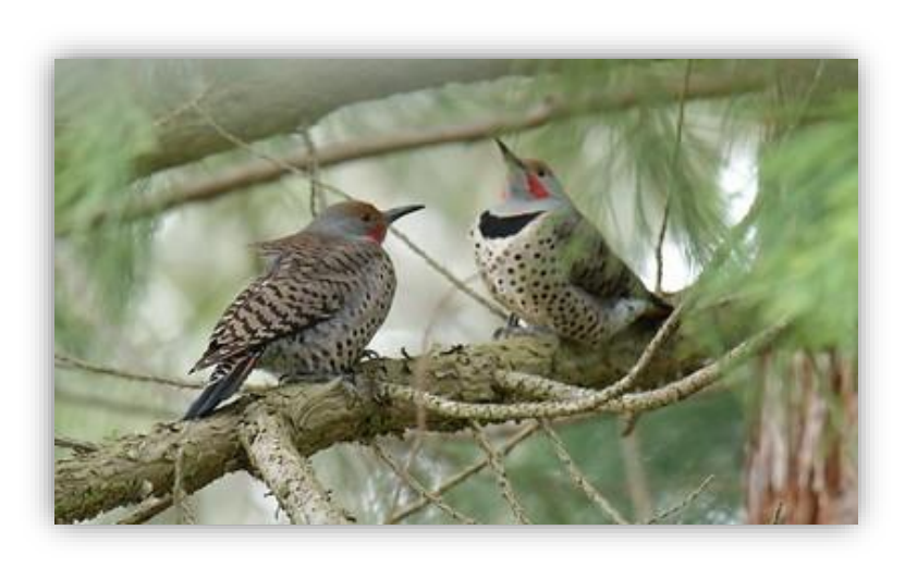
"If we are to succeed in saving our planet, the battle will be won or lost at the local level."