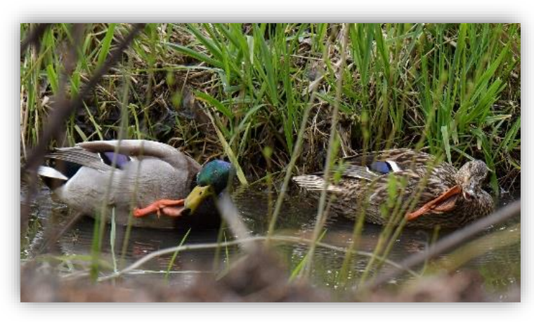
"The first rule in sustainability is to align with natural forces, or at least not try to defy them."