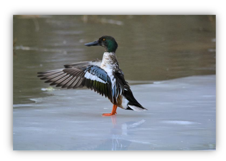
"Our task must be to free ourselves by widening our circle of compassion to embrace all living creatures and the whole of nature and its beauty."

"...those areas that are inundated or saturated by surface or ground water at a frequency and duration sufficient to support, and that under normal circumstances do support, a prevalence of vegetation typically adapted for life in saturated soil conditions. Wetlands generally include swamps, marshes, bogs, and similar areas." From: EPA Regulations listed at 40 CFR 230.3(t)