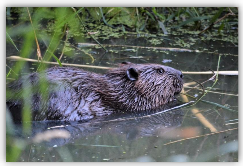
"This is what you should do- Love the Earth and sun and the animals."

That's where the job of a watershed fits into nature's scheme. A watershed is comprised of areas of land that cause water to flow downhill into streams, rivers, or lakes. This downward flow occurs on all land masses- whether large or small. Because water cannot travel uphill, all watersheds are determined by the natural land features or topography of the area.