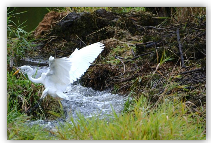
"The greatest threat to our planet is the belief that someone else will save it."

It is important to raise your concerns when the U.S. Army Corps of Engineers and the Oregon Department of State Lands are reviewing land use applications. These agencies may grant the permit as requested, apply conditions to a project, or deny the permit.